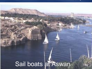
Sail boats at Aswan