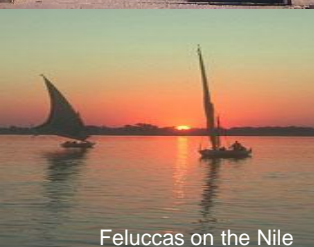
Feluccas on the Nile