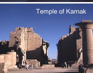
Temple of Karnak