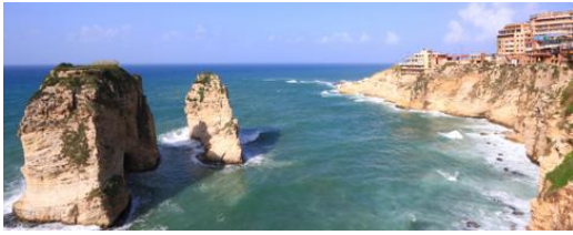
Pigeon Rocks Beirut