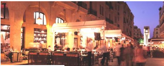
Nightlife in Beirut